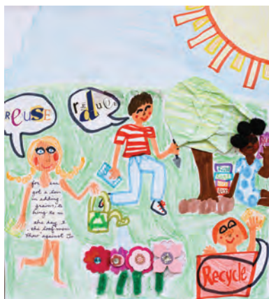
The poster above was created by Poppy Rusca, 5th grade student at Park Forest Elementary School.

Continued from Page 1. Don't forget to pick up a 2018 calendar, available free of charge at all 5 Centre County Weis Markets stores, to see all of the winning posters.